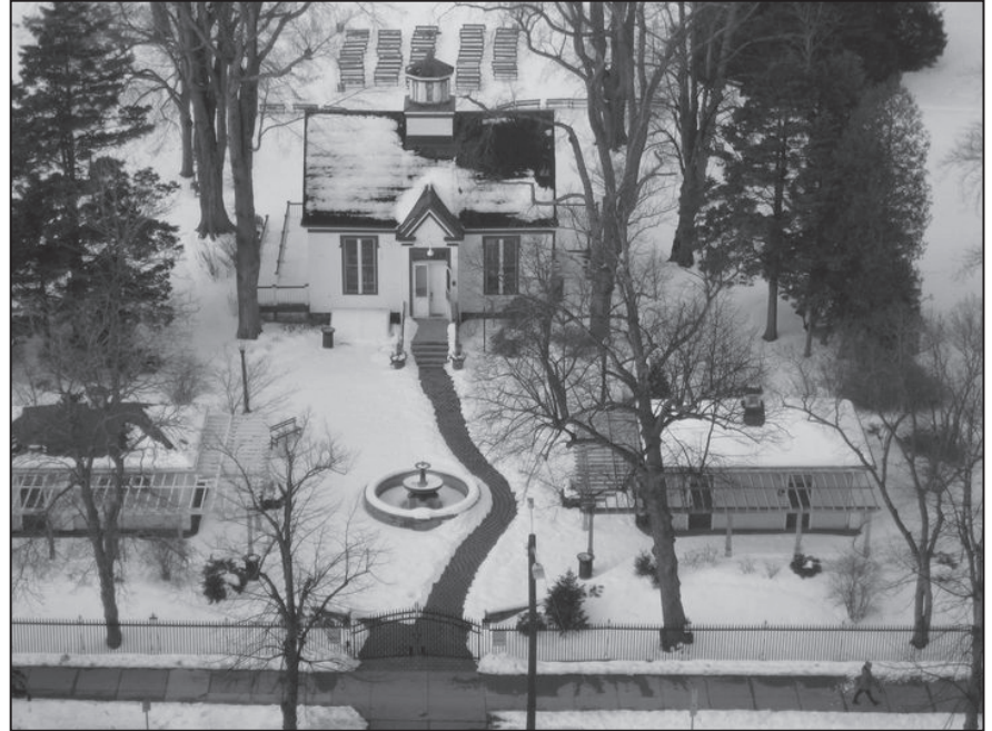
LOOK WHAT'S COMING...

The Friends will have a Members Carol-Singing event. The date to be announced soon with an Invitation to all members.